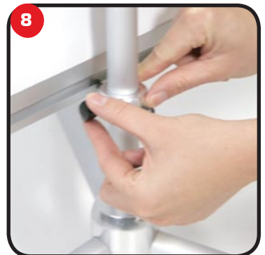
8 Put tension on graphic and tighten screw on bottom rail fitting.