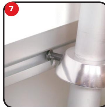
7 Attach bottom graphic rail to bottom rail fitting.