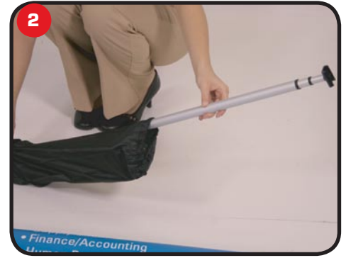
2 Remove unit from black bag.