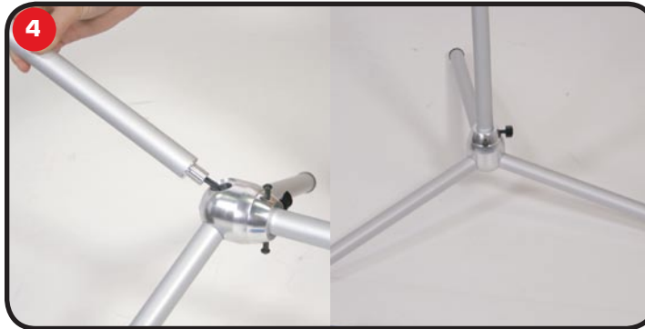
4 Attach legs to the base of unit, then stand unit upright.