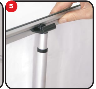
5 Attach top graphic rail to the top of the unit and let the graphic hang down.