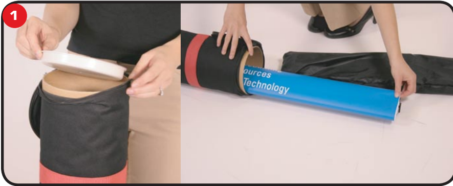
1 Unzip bag and remove cap, then remove graphic and unit from tube.