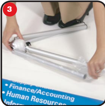
3 Remove plastic bags from legs of the unit and protective covering from the base.